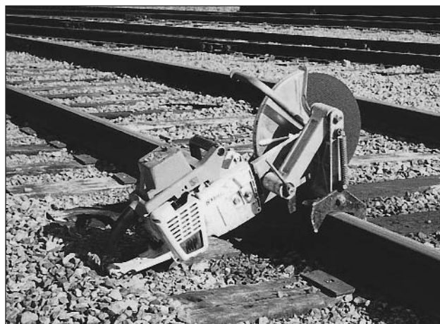
Stihl Rail Saw

Competitively priced. Available in all sizes.