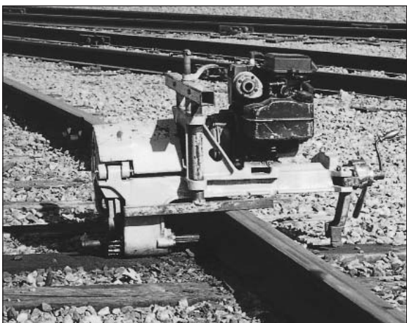
Model CD Nordberg Rail Drill

The lowest-cost way to move one railcar short distances. Car mover multiplies worker's efforts through compound leverage and rail-biting spurs. Hickory handle. 54" long. Wt. 20 lbs.